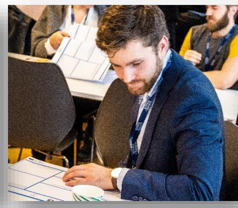
Oslo Science Park