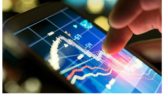
UiO : Global Health