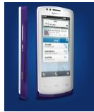
Nokia Symbian Belle 700