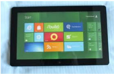
Samsung Windows Tablet prototype – demonstrated and handed out at Microsoft Build conference, September 13-16

A fast-moving new segment, with several models recently announced and demonstrated: