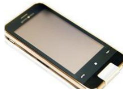
Fifth Media Axia A206