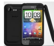
HTC Incredible S