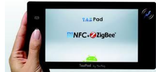
TazPad from TazTag aimed at retail use – launched in France