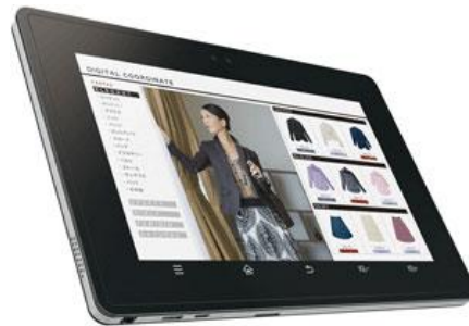
Sharp RW-T107 Android Tablet with NFC functionality built in – launched in Japan