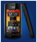
Nokia Symbian Belle 600