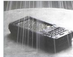
Casio Ruggedized IT-800RGC 35