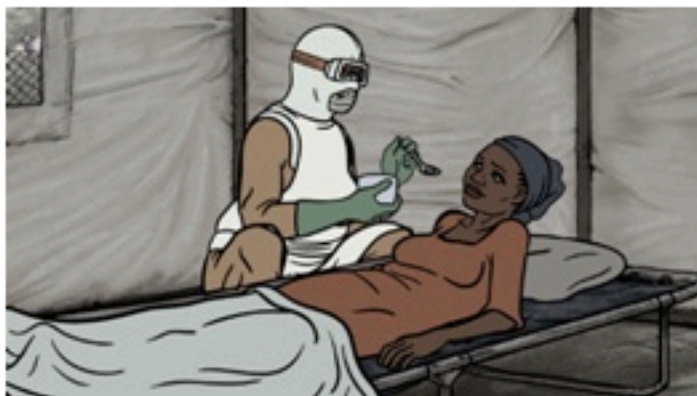
The Story of Ebola, English

All Small Baby Newborn Childbirth Breastfeeding Cholera