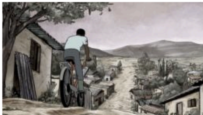
The Story of Ebola, Swahili

https://globalhealthmedia.org/videos/ebola-portfolio/