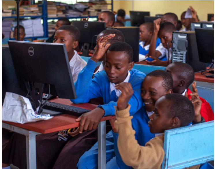
Figure 2: "Empower my dreams" in the connected school

The Foundation has developed solutions for setting up wireless information spots ("InfoSpots") in areas where there is no internet, or where no one believes you can connect (see Figure 1). We have established InfoSpots more than 20 km from mobile phone base stations, and are piloting solutions to reach more than 30 km. Through these InfoSpots and our collaborations, we provide and promote Internet Lite, the freemium access model.