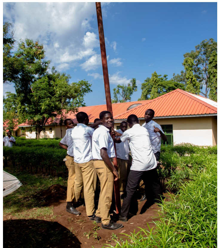
Figure 1: Establishing an InfoSpot, a collaborative work

The aim of the installation is to establish digital inclusion in the community through InfoSpots, community networks and other means of access. In addition to connectivity, which is at the core of the planned collaboration with our local partners, empowerment and value creation for local societies is the second pillar. We address the second pillar through a decentralised internet with a school/community