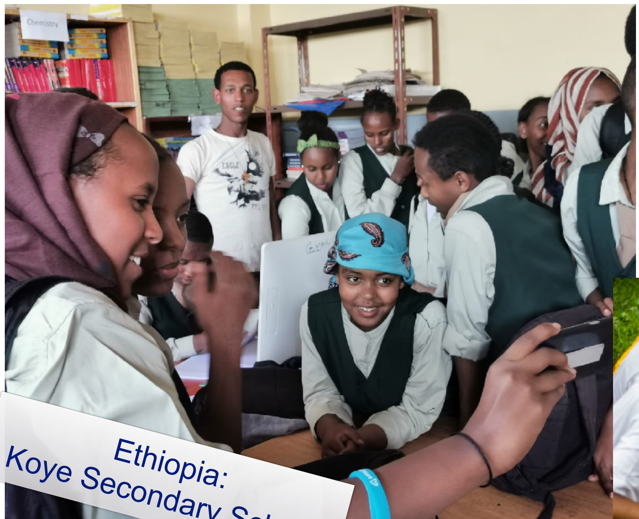
Ethiopia: Koye Secondary School