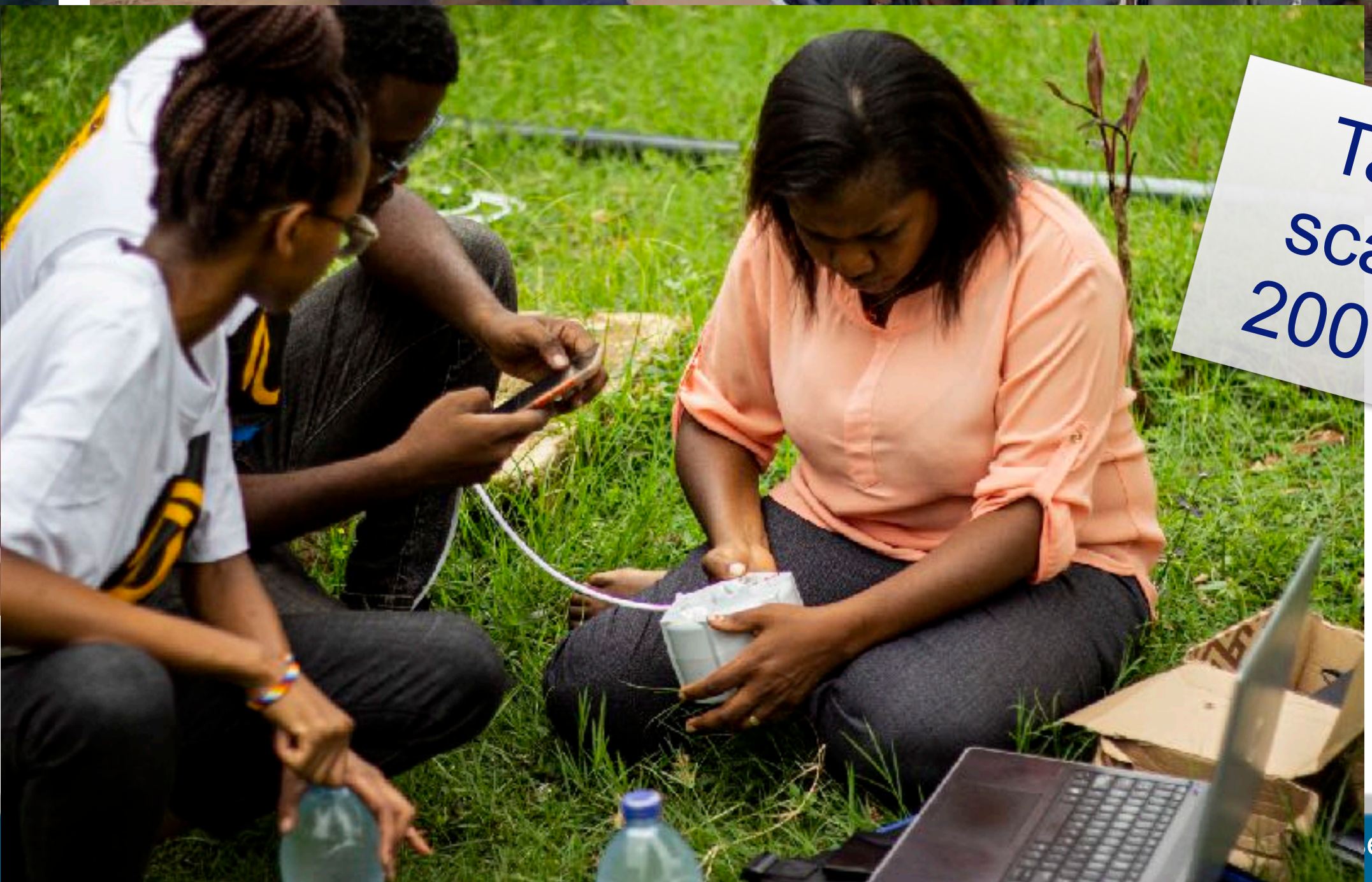
Tanzania: scale up to 200 schools